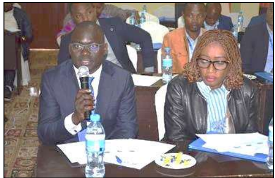
Lectures in Progress and Questions