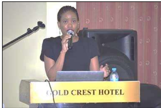
Lectures being Delivered