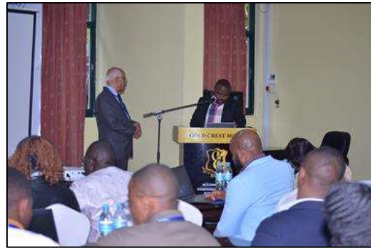
Participants Presenting Design Stage Audit Report