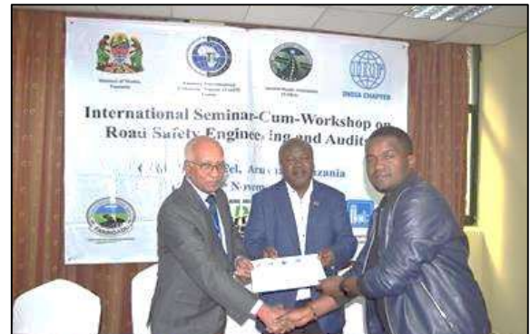
Participants Receiving Certificate