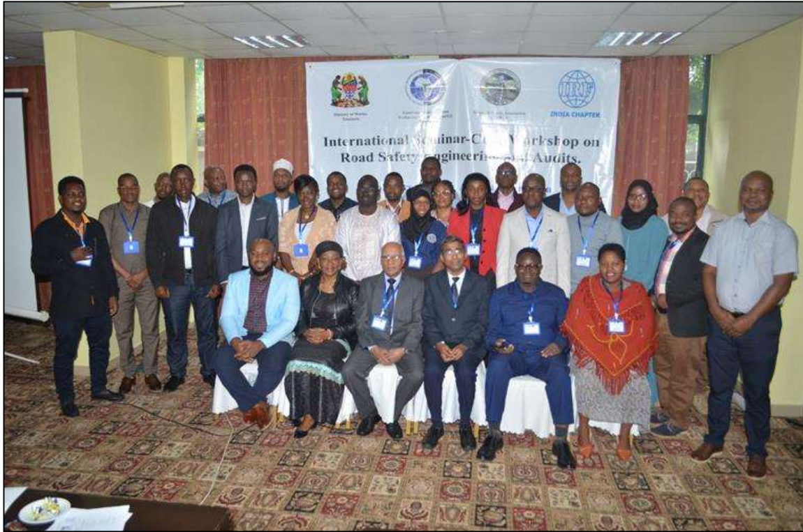
Group Photograph of Participants