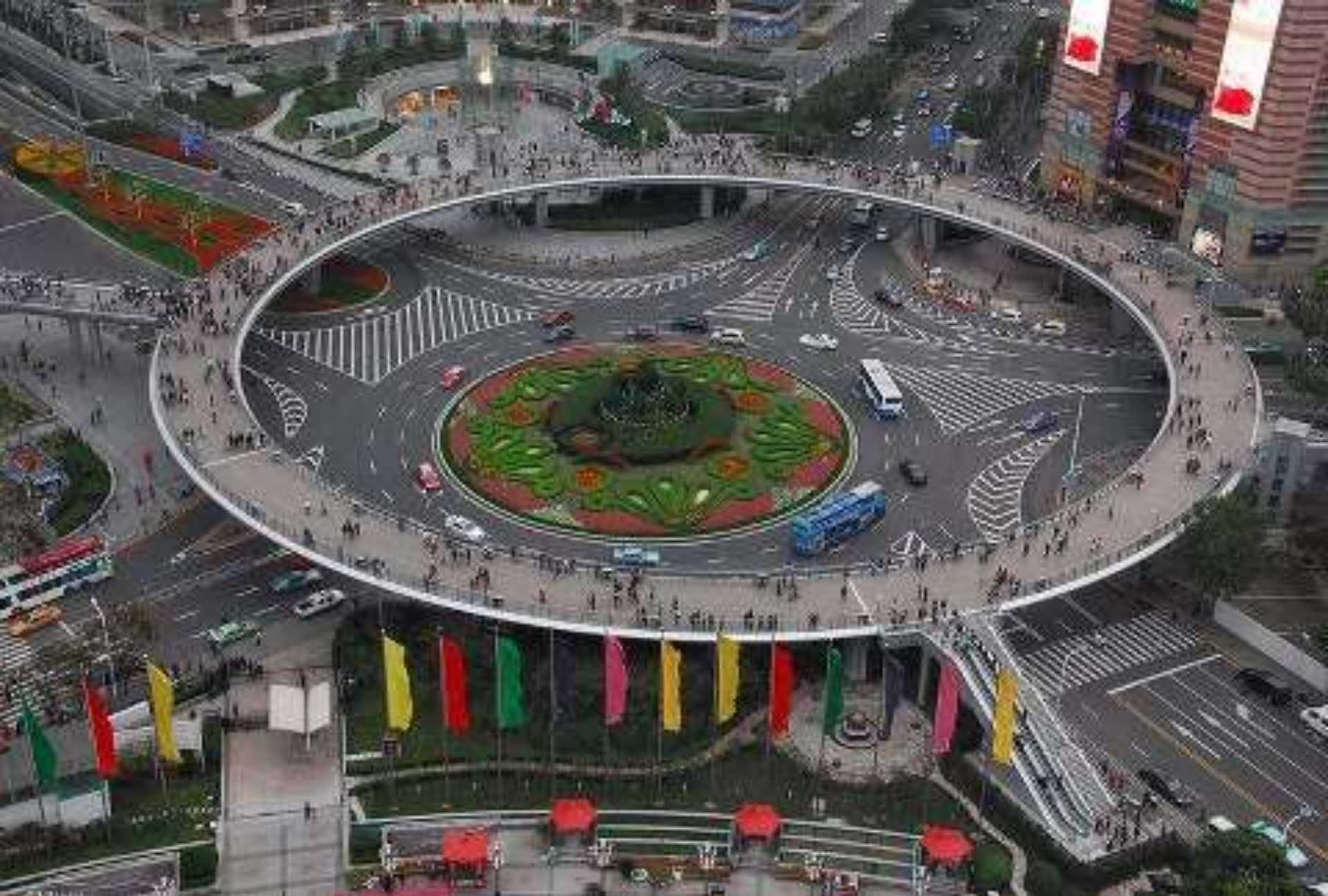
Elevated Non-Motorised Traffic Rotary in China