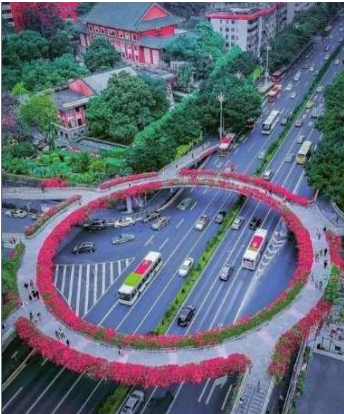
Elevated Pedestrian Traffic Rotary in China